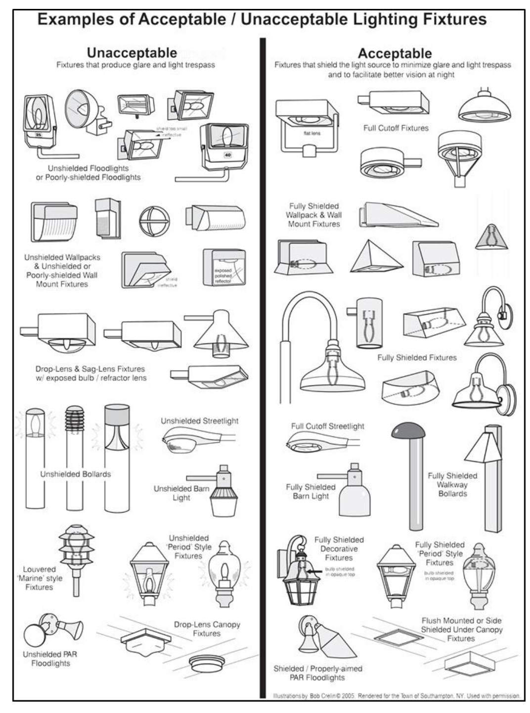
Figure 3 Examples of acceptable and unacceptable lighting fixtures or "luminaires." The intent of this figure is to demonstrate that "acceptable" lighting eliminates or reduces glare by hiding the light emitting portion of the bulb or lamp, not that the general style of fixture is prohibited.